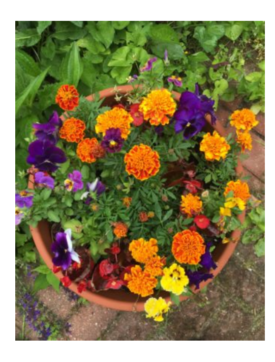
Characteristics of the Five Buddha Families Chart