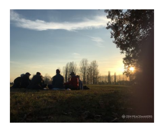
The Way of Council